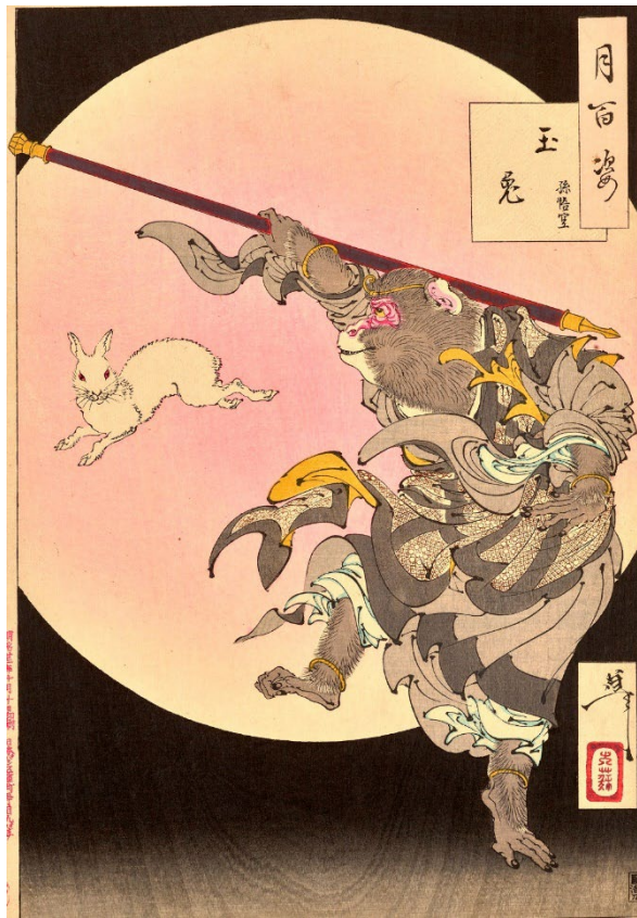
Tsukioka Yoshitoshi 月岡芳年 (1839-1892) Jade Rabbit – Sun Wukong from the series « One Hundred Aspects of the Moon », 1889 Fondation Baur, FB.DFC.2019.19