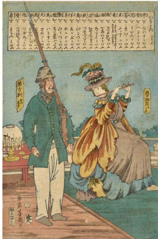
Utagawa Yoshiiku 歌川芳幾 (1833-1904) Russian woman and British soldier, 1860 Fondation Baur, FB.FHF.2016.13