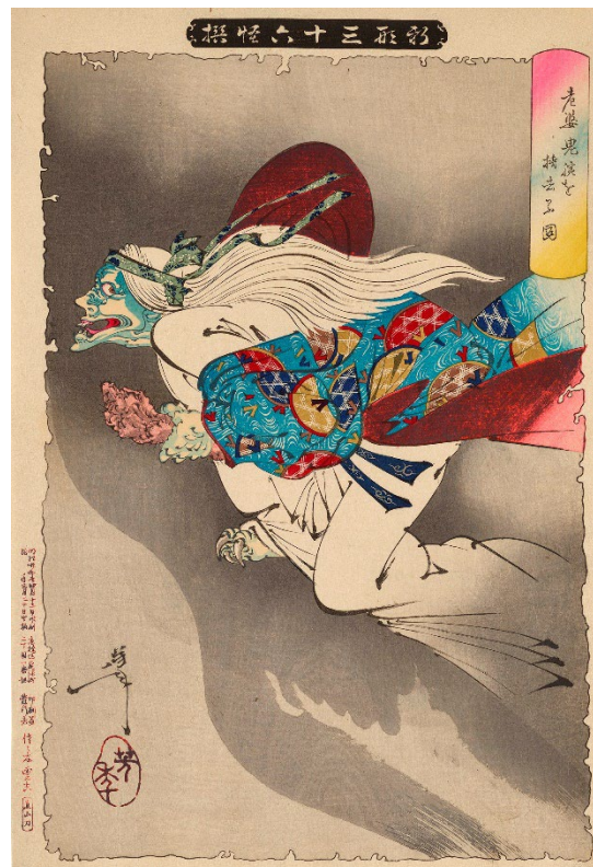
Tsukioka Yoshitoshi 月岡芳年 (1839-1892), The old woman retrieves her arm from the series “New Forms of Thirty-six Ghosts”, 1889 Fondation Baur, FB.DFC.2019.16